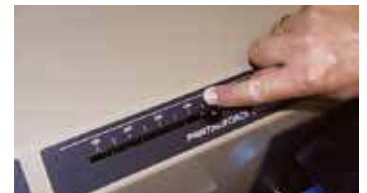
Adjusting printing force