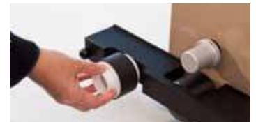
Sliding disc on shaft