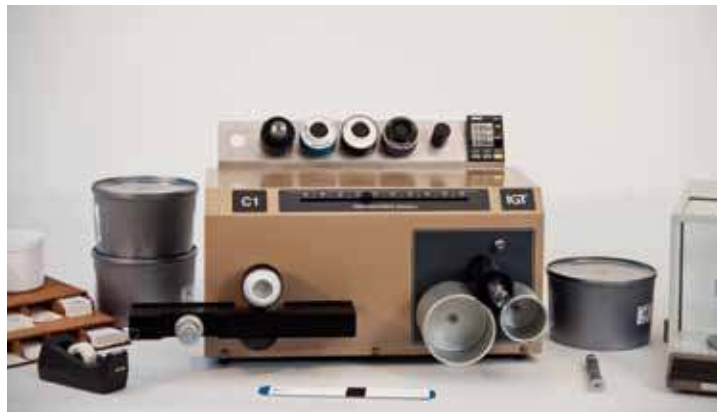
Ready to use