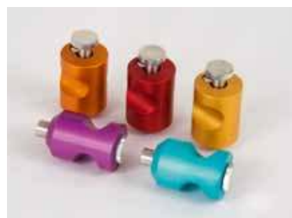
The IGT fixed volume ink pipettes

The standard printing disc is covered with a rubber or a rubber blanket for conventional inks. Discs are available with rubber or a rubber blanket for UV-curing inks. Furthermore, there is a printing disc with an aluminium surface. The weight of the printing discs is less than 160 g, so they can be weighed on most analytical balances. To print halftones there is a wide choice in special discs with halftone photopolymer 40-70 l/cm. On request these ones can also be customized.