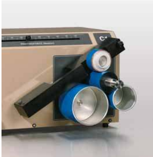
Inking the printing disc