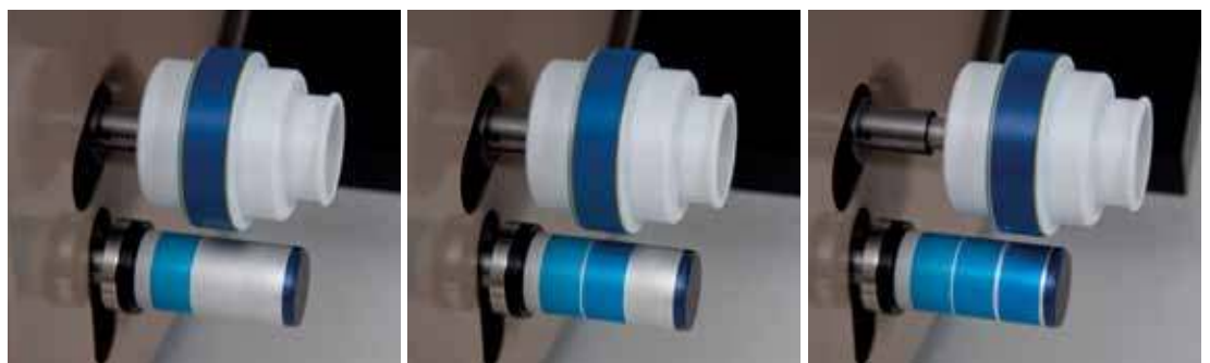
Printing on cans and tubes with CTx3

All C1 testers allow to print on cans with a diameter between 63 and 68 mm. The CTx3 is especially designed to print three strips of 15 mm, besides each other, directly on cans and tubes with a diameter between 16 and 68 mm. This unit is equipped with an easy exchangeable impression cylinder to slide the tin or tube on. Also prints of 35 mm wide can be made on tins and cans. With the CTx3 prints of 35 mm or 3x15 mm and regular prints on flat substrates can be produced as well.