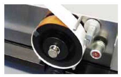
Mounting substrate for gravure

Most of the times the 40 mm print width is sufficient, but sometimes a wider print width is desired. This device has its most frequent application in electronics industry. With special inks and/or substrates a wider print can give a better appraisal of the printing quality.